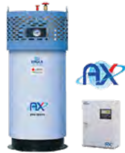
Kagla LPG Vaporizer