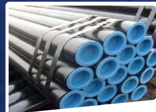
CS Pipes / MS pipes / ERW Pipes