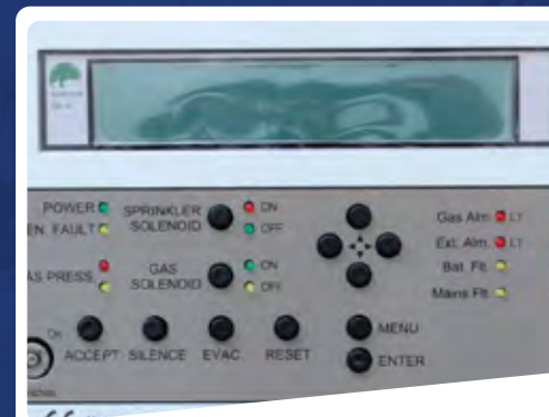
EDS LPG Detection System