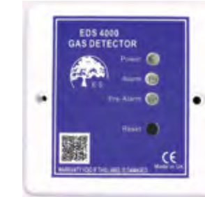
EDS LPG Domestic Detector