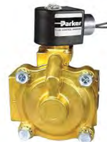
Parker LPG Solenoid Valves