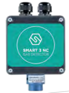
Sensitron Gas Detector & Control Panel