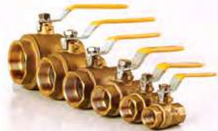
Bond Ball Valve