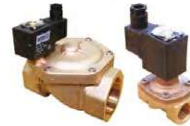
Gevax LPG Solenoid Valves